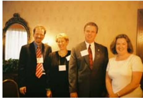
Community Engagement 101 Panel